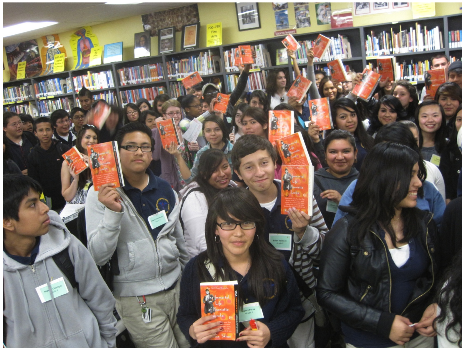
Orthopaedic Hospital Medical Magnet High School, 2/24/2012.