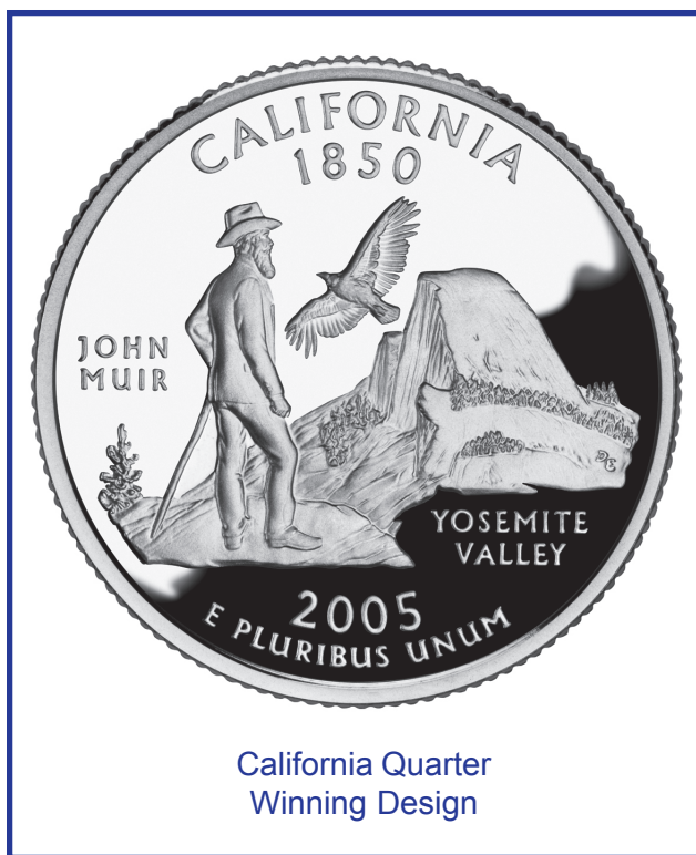
California Quarter Winning Design