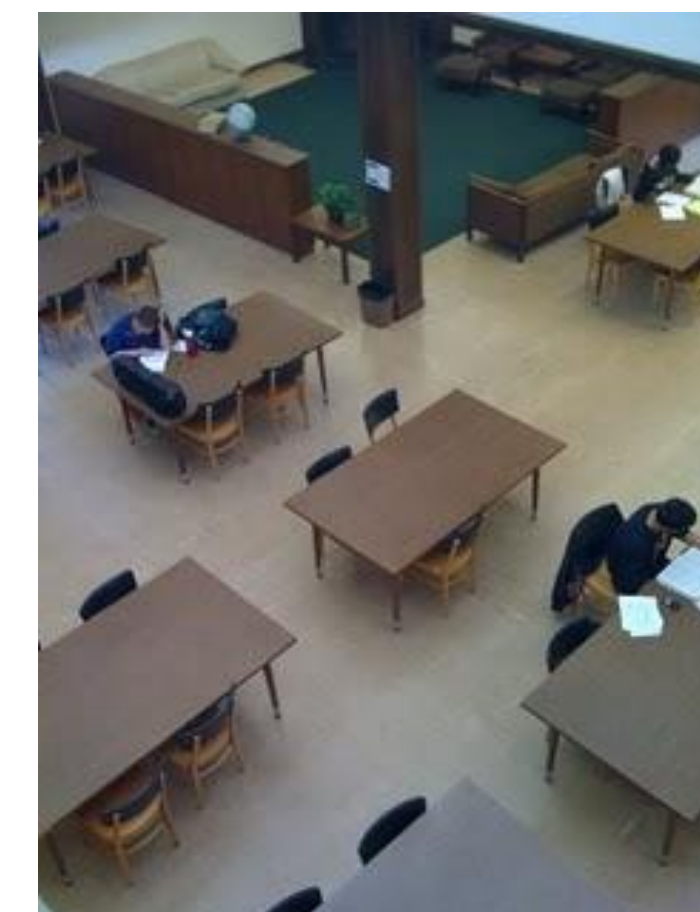
From the before to the after pictures—how the reading room was transformed