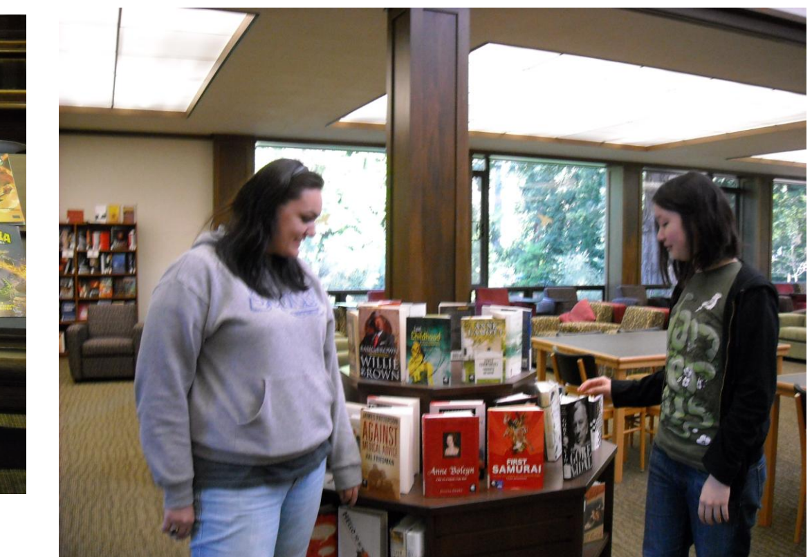
Browsing the Kiosk